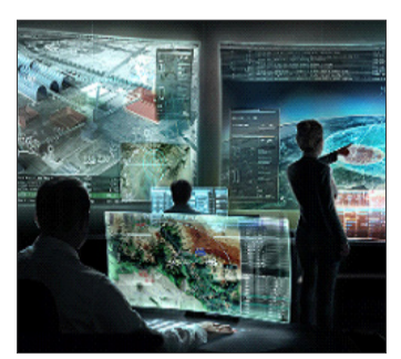
Global Situational Awareness for Rapid Decision-Making