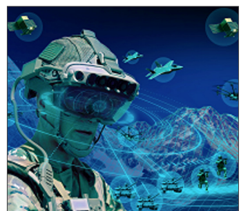
Intelligence, Surveillance, and Reconnaissance (ISR) and Sensor Fusion Edge Processing