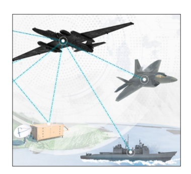
Resilient Communications for Joint All-Domain Operations